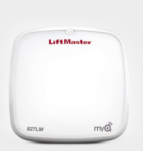
myQ Remote LED Light Easily mounts in minutes to provide light to any location in the garage.