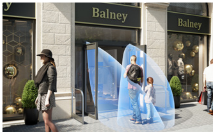
Double swing door