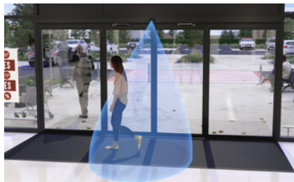
Cross traffic rejection