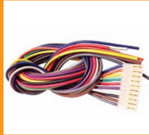
HAR-7 Pin Female Harness