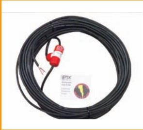
EMX Lite Preformed Loop