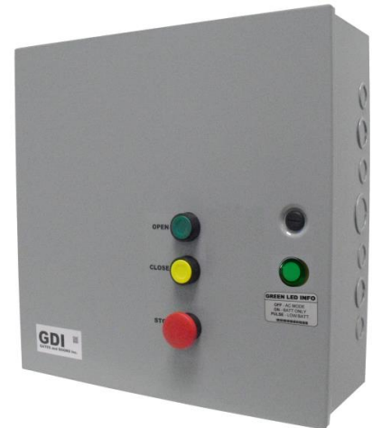
NEMA 1 Control Panel