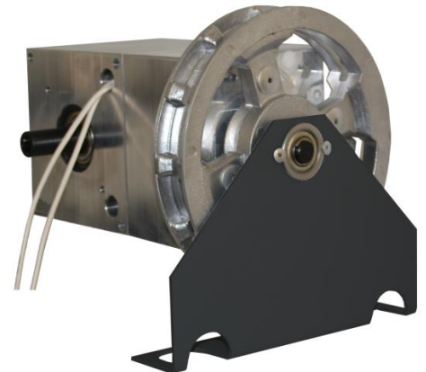
Right angle chain hoist add on