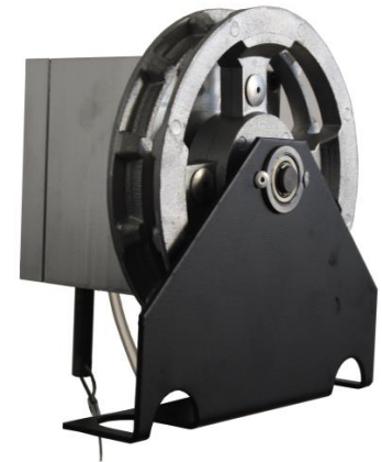
Axial chain hoist add on