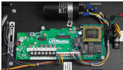
Includes the Medium-Duty Logic Board with Built-In Receiver