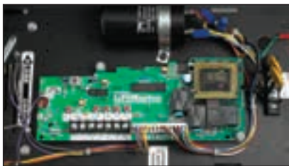
Includes the Medium-Duty Logic Board with Built-In Receiver