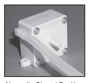
Normally Closed Position