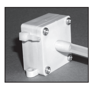
Normally Open Position