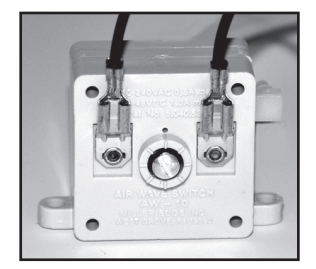
AW10 Air-Wave Switch

To adjust the sensitivity of the switch, you will find an adjustment screw located on the opposite side of the normally open feed tube.