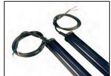
Receiver (left) Emitter (right)