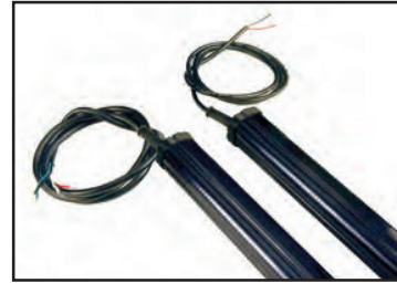
Receiver (left) Emitter (right)